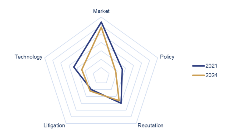
Figure 4. Assessment of transition risk for each of the TCFD categories before and after mitigation (2021 and 2024 respectfully).

Following this assessment, several workstreams were launched between 2021 and 2024 to mitigate the main risks (as can be seen in Figure 4). These workstreams are described below.