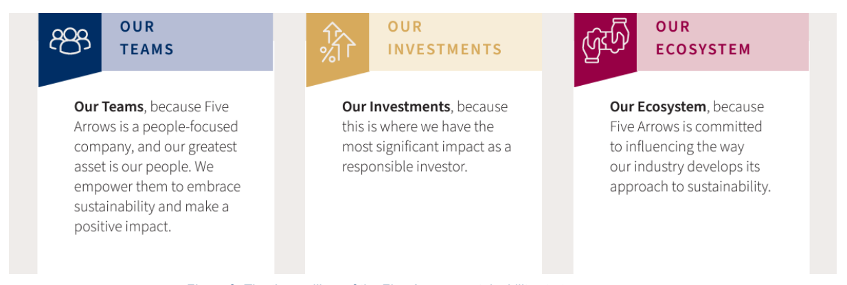
Figure 2. The three pillars of the Five Arrows sustainability strategy

Our Strategy is built on three pillars that interact as pieces of the same puzzle. Each piece is declined into a set of commitments that we take within Our Teams, Our Investments and Our Ecosystem. These puzzle pieces, once assembled, form the approach chosen by Five Arrows to reach its purpose: Maximise long term value creation for all stakeholders by being a responsible investor and promoting sustainability across our business.